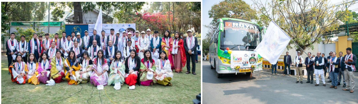
'Chief Minister of Manipur Official Residence'

Imphal, 20 February 2023: The Hon'ble Chief Minister of Manipur officially flagged off the students who will be visiting Maharashtra as a part of Ek Bharat Shreshtha Bharat(EBSB) Yuva Sangam from his official residence.