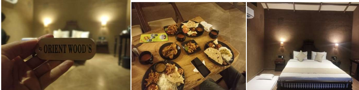
“Oriented Wood’s Resorts Pench”

The team again started their journey to Pench National park and the 2 nd day was concluded with a dinner in Oriented Wood's Resorts and overnight stayed at the Resorts.