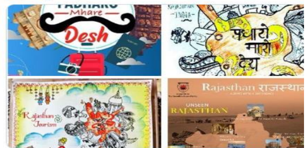
7:51 pm · 12 May 2020 · Twitter for iPhone