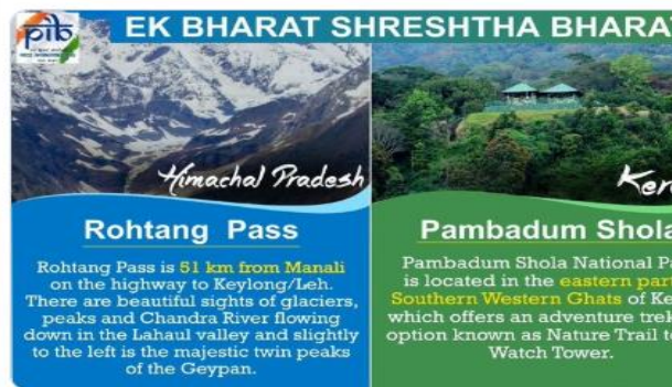
7:00 pm · 29 May 2020 · Twitter Web App

Lets us promote the spirit of national integration & celebrate #EkBharatShreshthaBharat