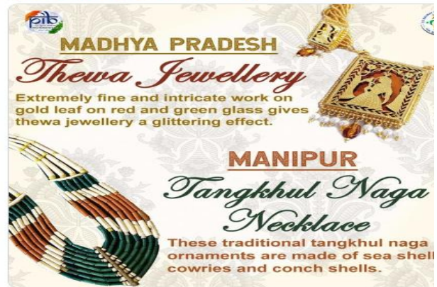
7:14 pm · 29 May 2020 · Twitter Web App