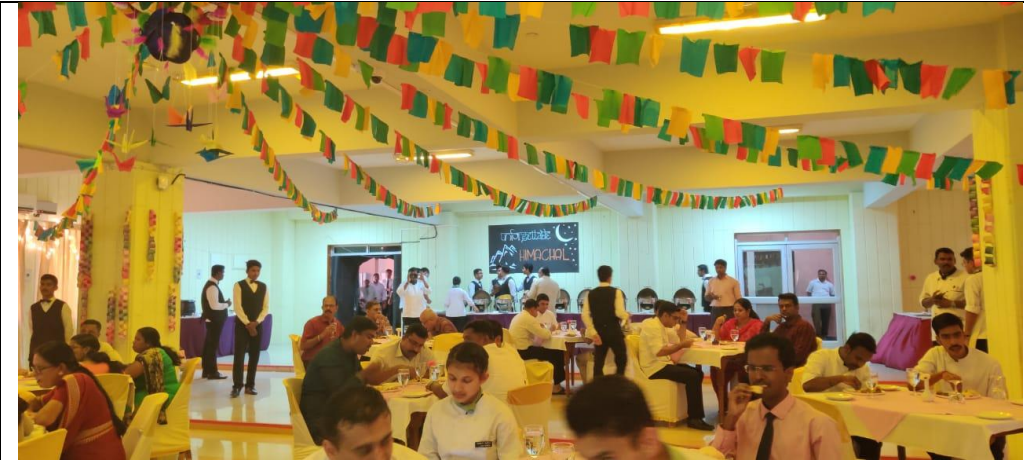
Lunch & Breakfast