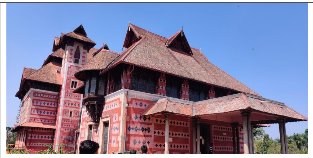
Visit Temple The Napier Museum