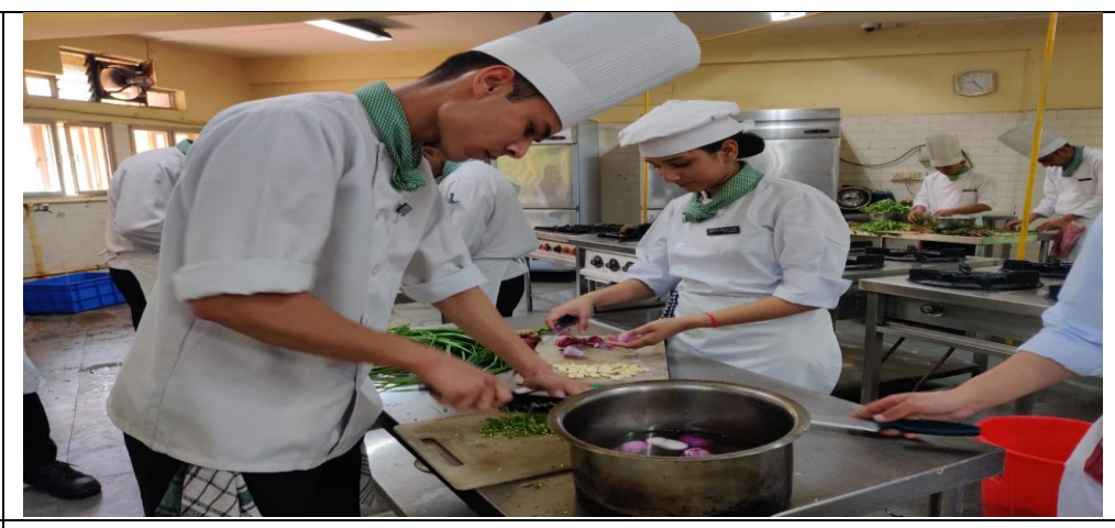
Theme Lunch Preparation