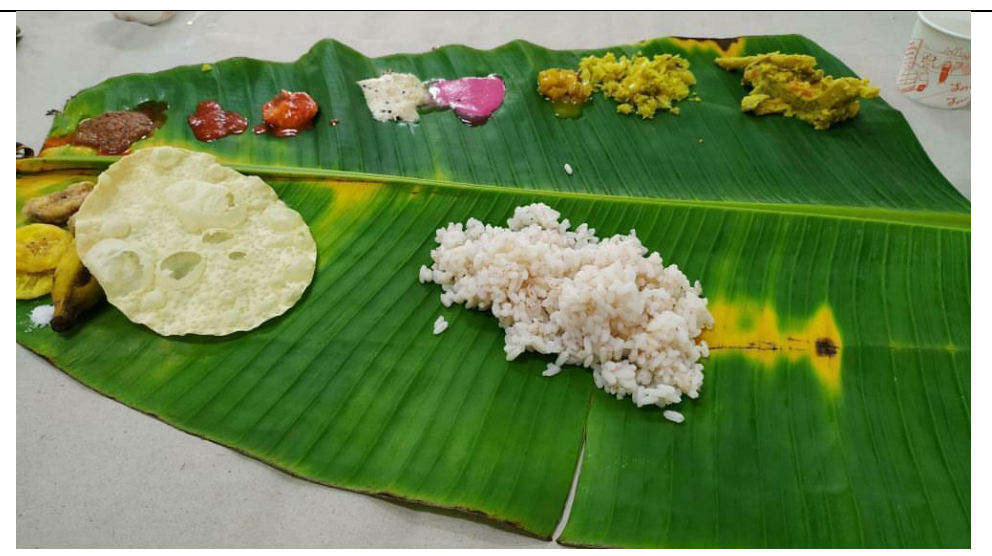
" A typical Sadhya can have about 24-28 Dishes served as a single course.