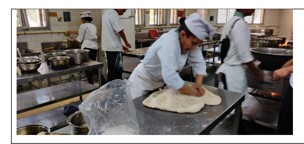
Theme Lunch Preparation