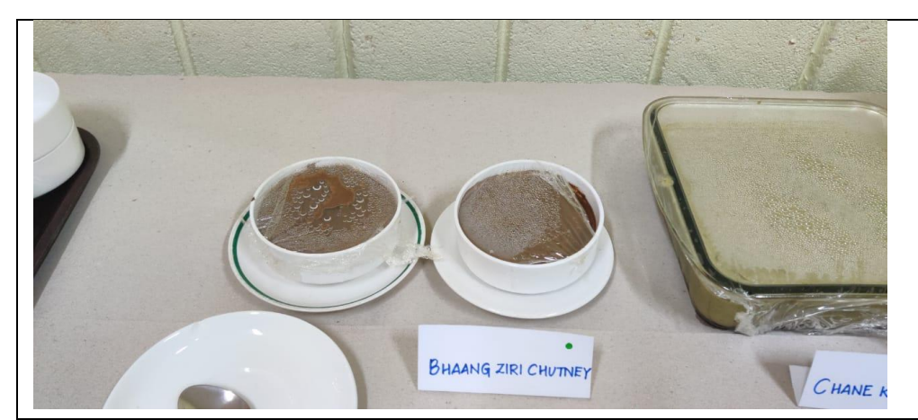
Himachali Theme Lunch (Bhaangziri Chutney)