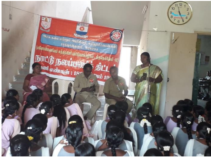
26.01.2020 – Republic day celebration: