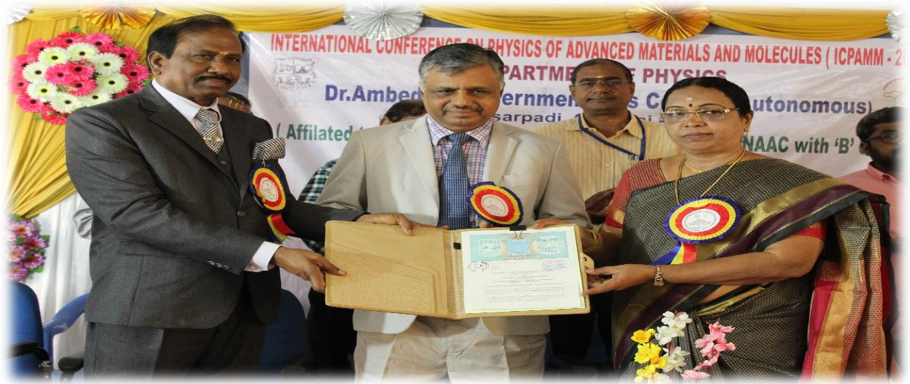
Release of MoU -signed between the College and ISPA