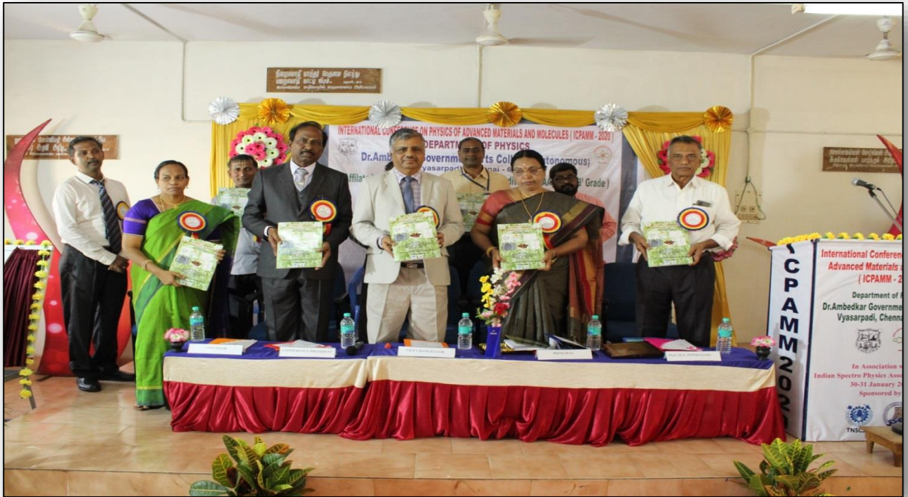
Release of Proceedings: ICPAMM 2020