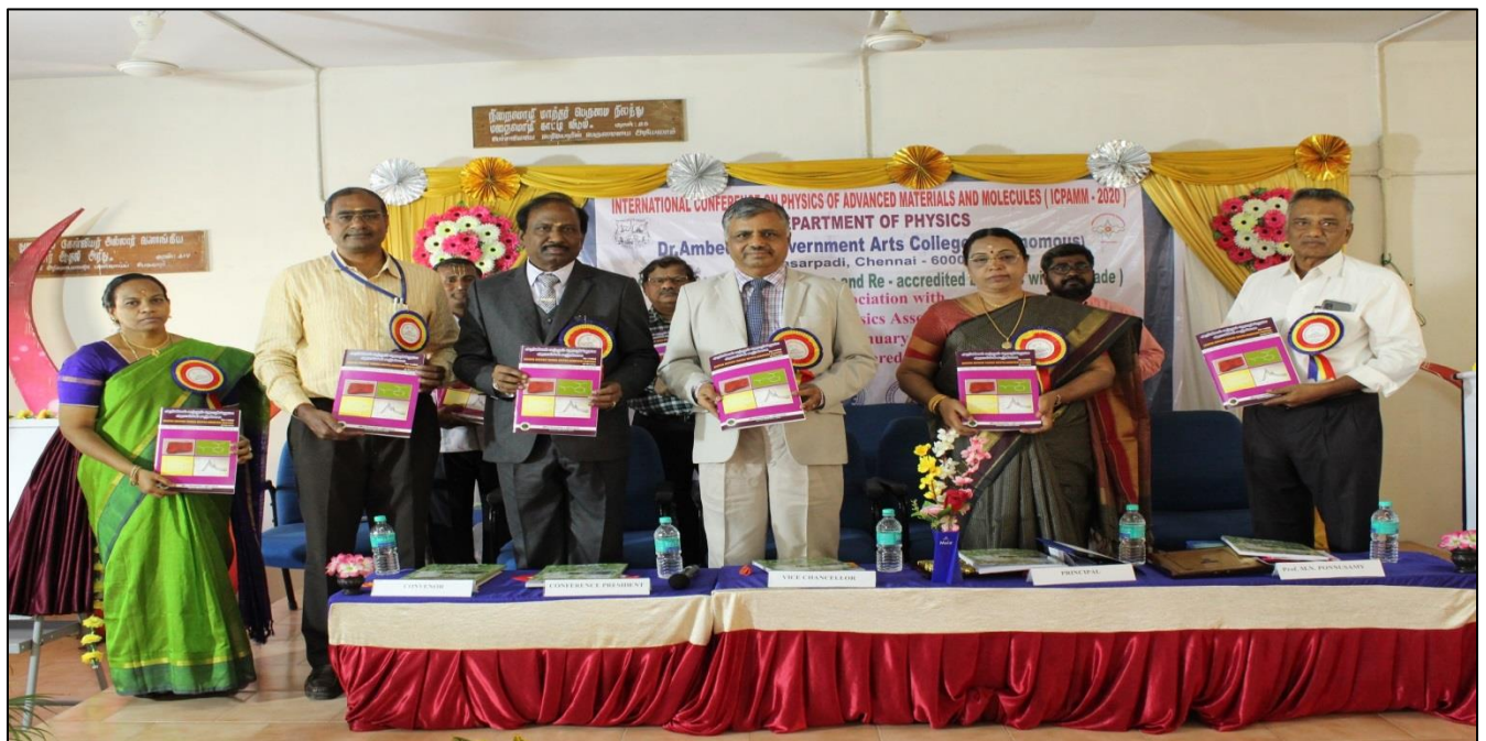
Release of Tamil Journal: ISTA