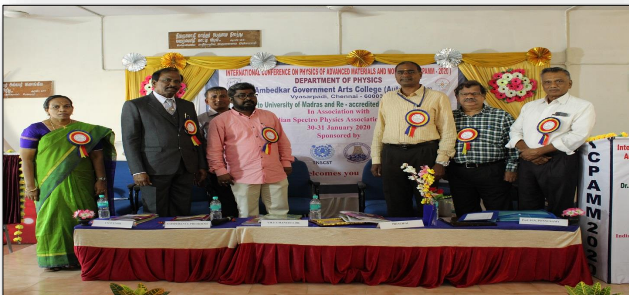
Invitees on the dias during inauguration