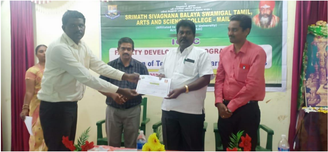
News Program Video