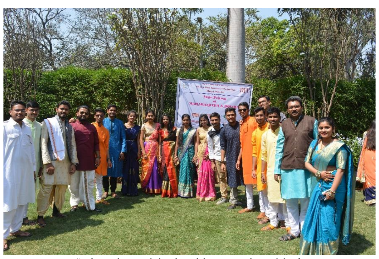
Students along with faculty celebrating traditional day by wearing cloths of different traditions