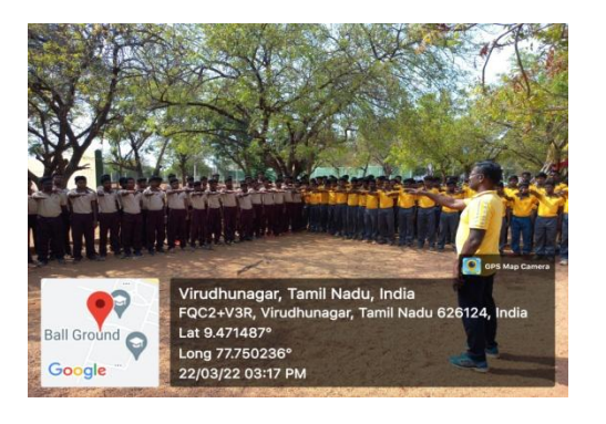
DEPARTMENT OF PHS (U.G)