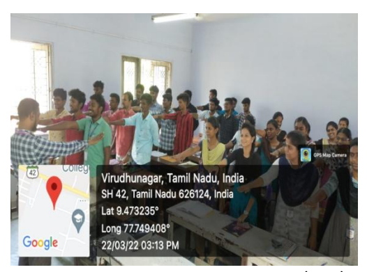
DEPARTMENT OF CHEMISTRY (U.G)