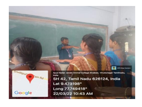
DEPARTMENT OF MATHS (U.G)