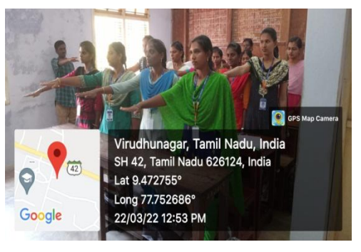
DEPARTMENT OF ZOOLOGY (P.G)