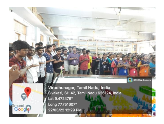
DEPARTMENT OF ZOOLOGY (U.G)