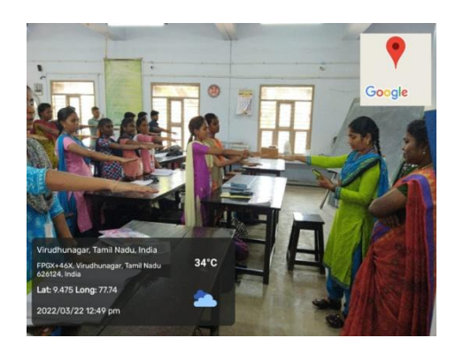
DEPARTMENT OF BOTANY (U.G)