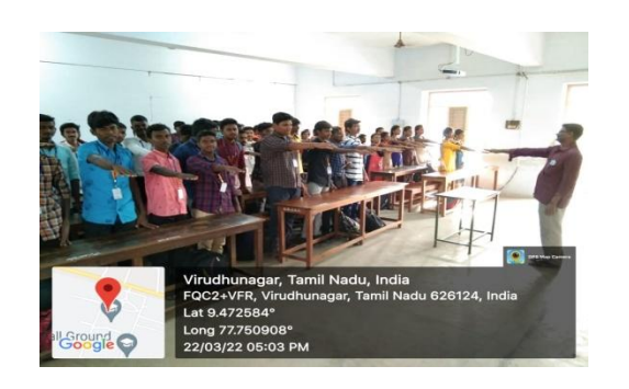
DEPARTMENT OF B.B.A(R)