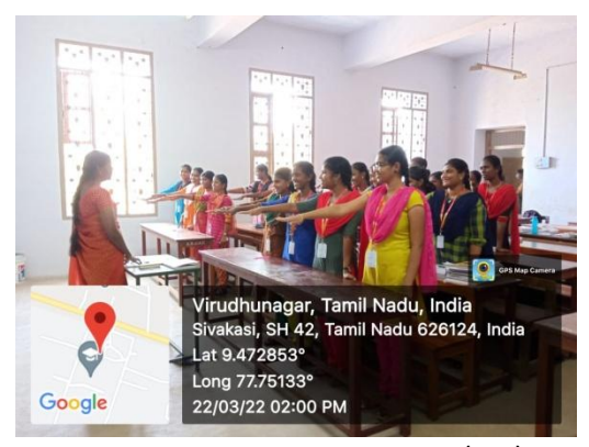
DEPARTMENT OF B.COM(P.A)