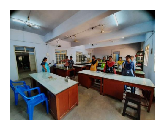
DEPARTMENT OF BOTANY (P.G)