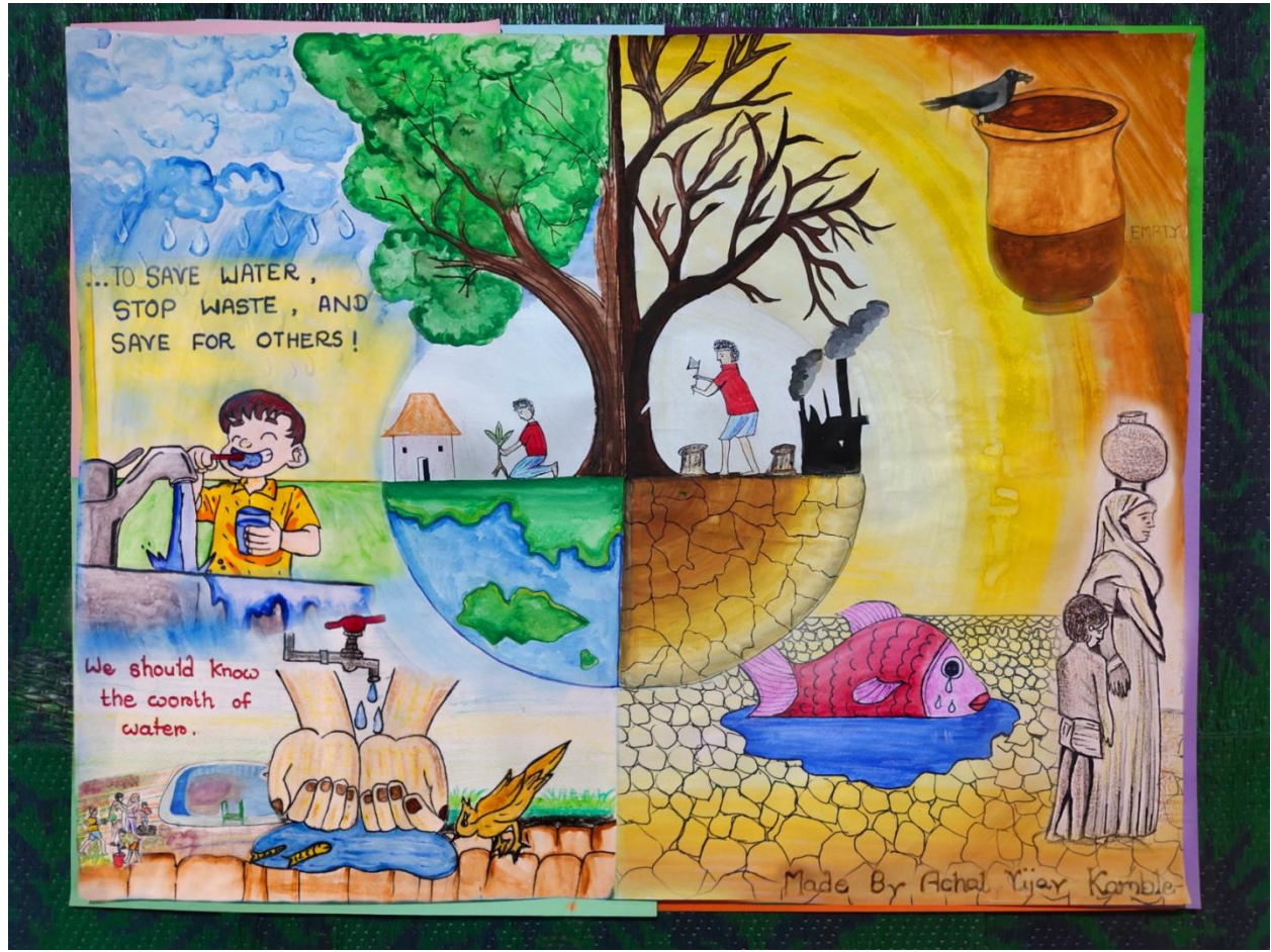
By Achal Kamble-1 st Winner