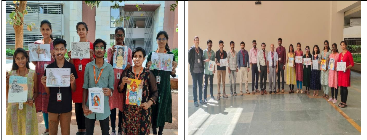
Sample pictures of the event