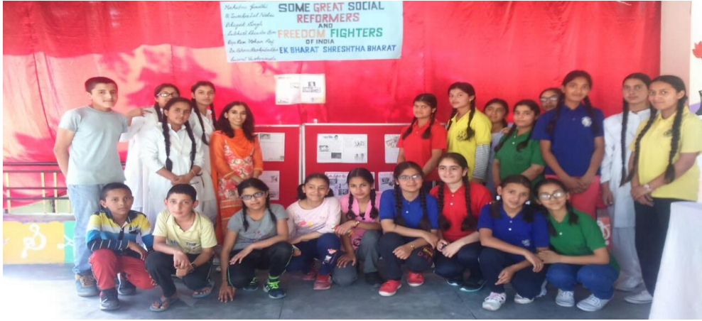
Group photograph of essay participants.