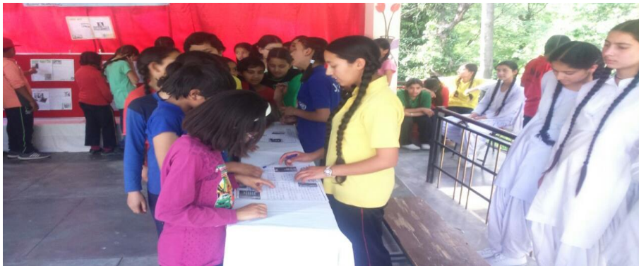
Displayed essay are read by students