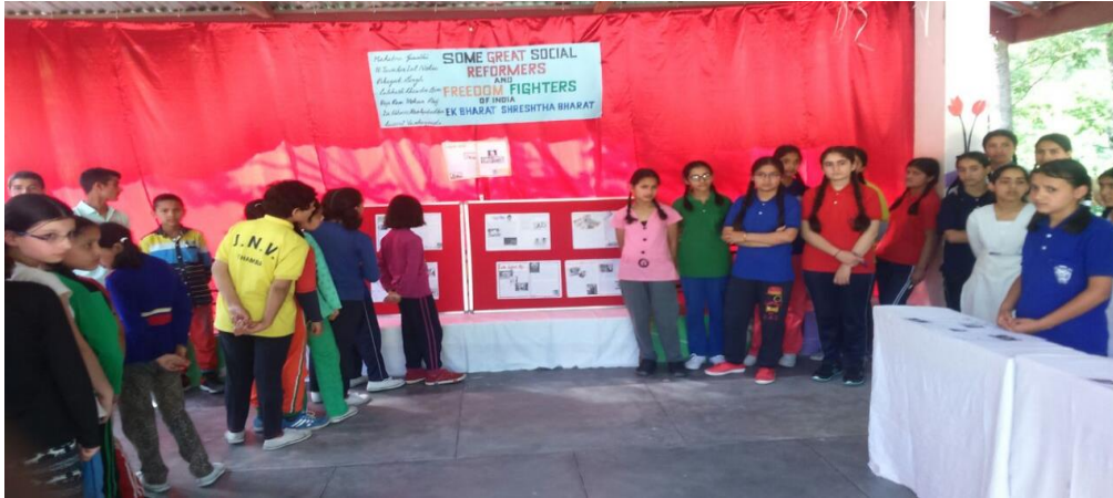
Students watching the work of their fellow students