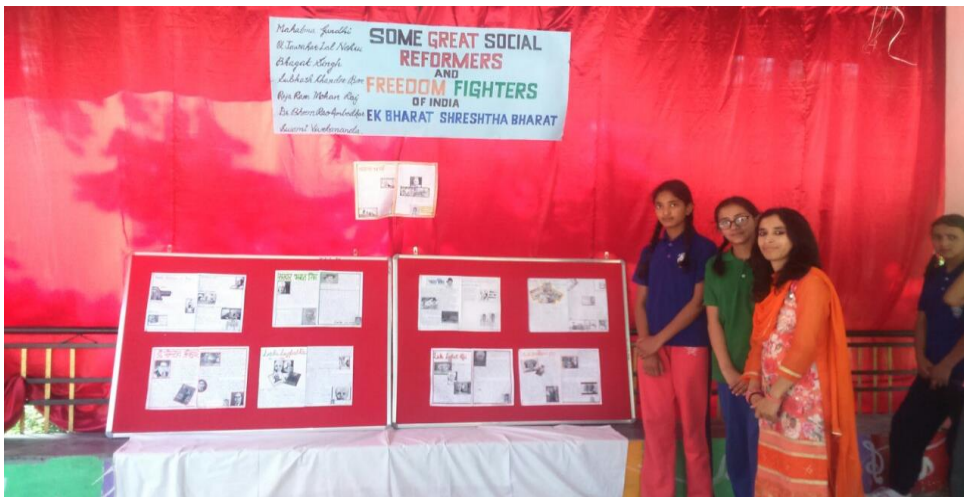
Photos of essay writing on notice board with students