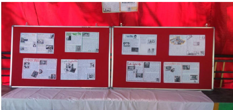
The creativity of students (Essays) on display board